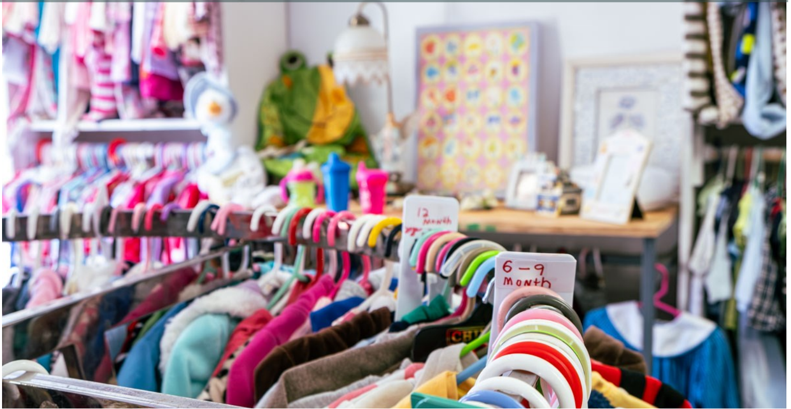
The new Across the Map clothing ministry has a dedicated baby and toddler room.

The Across the Map clothing ministry site gives away free clothes to anyone who stops in.